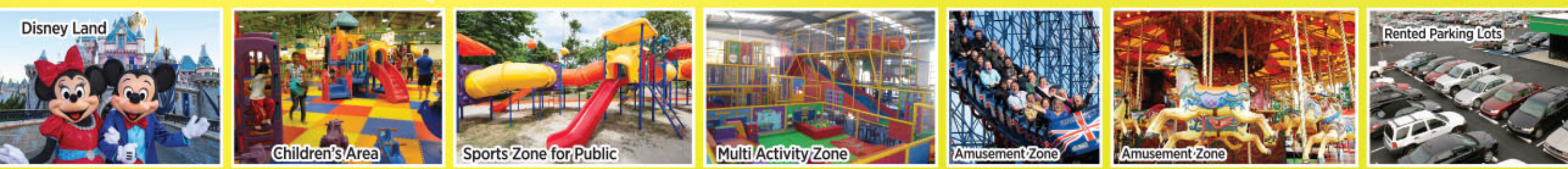
***All Pictures shown are for reference purpose only. Actual product may vary due to product enhancement.

Improve the sensation of health and happiness of people through the accessibility and quality of the green infrastructure (natural resources and recreational facilities ) in Diyatha Uyana and to enhance the sensitiveness of the environment by the development activities.