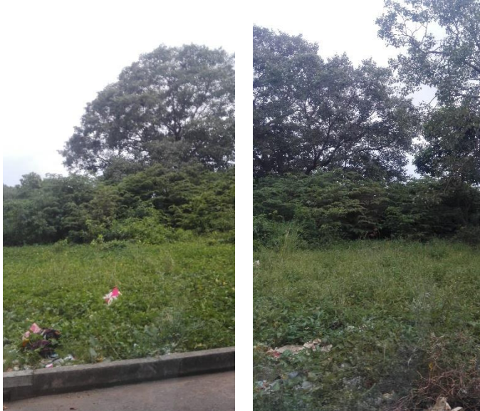
Figure 2: Pictures of the proposed land

750 new housing units have been proposed for Ferguson. A layout plan was unavailable at the time of assessment but will be developed by the design and build contractor upon award of the bid. Each apartment tower will consist of the ground floor and another 14 floors. Ground floor will consist of courtyards (open to sky), shops, community hall, maintenance office, nursery and day care center, common toilets, police post cum fire commanding center and janitorial room per block. Each apartment tower will also have a health center and a parking area. Each housing unit within the apartment complex will have a minimum floor area of 400 sq.ft. Each housing unit will include living room, two bed rooms, kitchen, bath and toilet (separated) and balcony. Brief detail of the common commodities planned under the scope of work for this subproject by UDA is provided below.