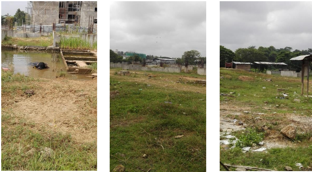
Figure 2: Pictures of the proposed land

At Colabage Mawatha, 624 new housing units have been proposed. A layout plan was unavailable at the time of assessment. It will be developed by the design and build contractor upon award of the bid. Each apartment tower will consist of the ground floor and another 11 floors. The ground floor will consist of courtyards (open to sky), shops, community hall, maintenance office, nursery and day care center, common toilets, police post cum fire commanding center and one janitorial room per block. Each apartment tower will also have a health center and a parking area. Each housing unit within the apartment complex will have a minimum floor area of 450 sq.ft. Each housing unit will include living room, two bed rooms, kitchen, bath and toilet (separated) and balcony. Brief detail of the common commodities planned under the scope of work for this subproject by UDA is provided below.