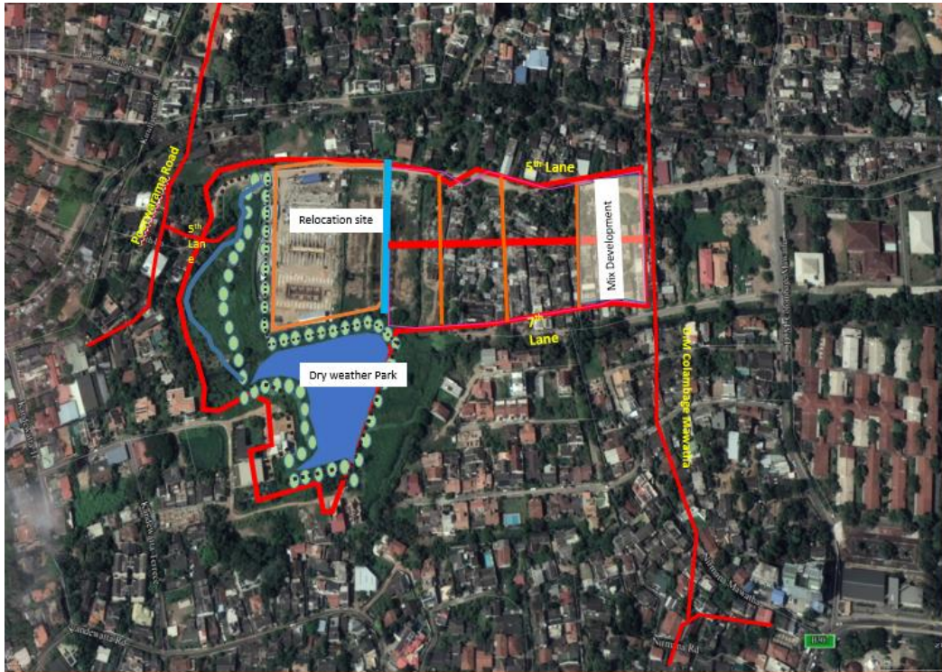
Figure 1: Location of the project site and the development plan for the area

area of influence consists of the following significant establishments; Open University of Sri Lanka, Kirulapone Railway and High Level road which are within a 500 m radius. The total population in Kirulapone is 17,846 and among them 7221 are employed. Site area is bounded by D.M Colambage Mawatha, 7 th Lane, 5 th Lane and Poorwarama Road. See Figure 1 for site location area and UDA's development plan for the area.